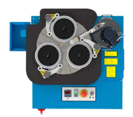
Open face version