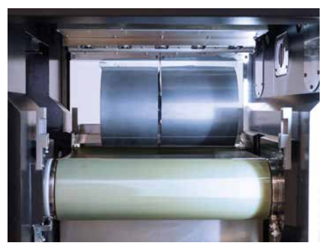
Long load length for high output