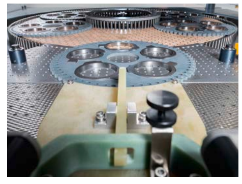
AC 880-F with gap loading table and loading tool