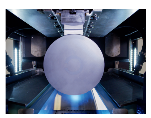
Optimized axis distance for higher wafer quality