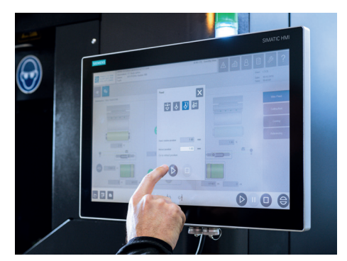
Easy operation for higher yield