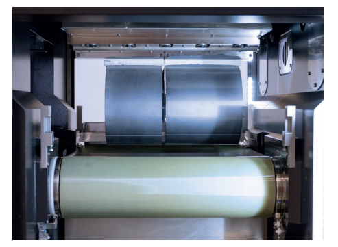
Long load length for high output