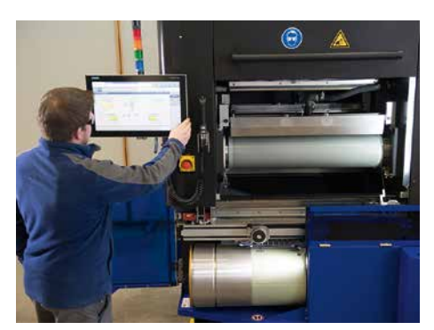
Easy operation for higher yield