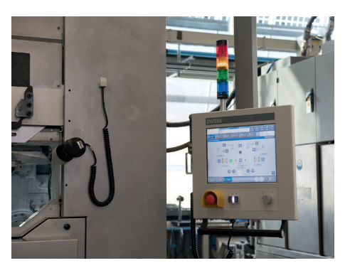
Easy operation for higher yield