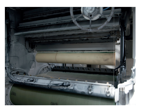
Longer load length for higher capacity