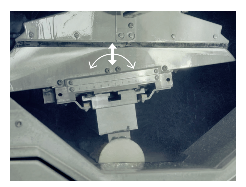
Optimized rocking for higher wafer quality