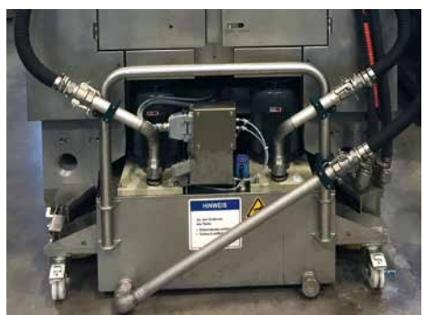
Optimized cutting fluid system for lower downtime