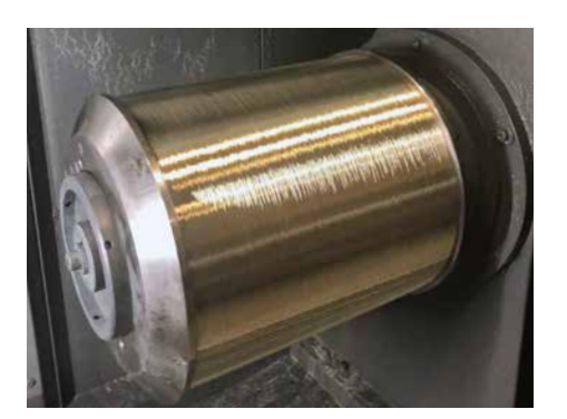
High wire volume for higher capacity