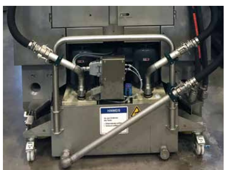
Optimized cutting fluid system for lower downtime