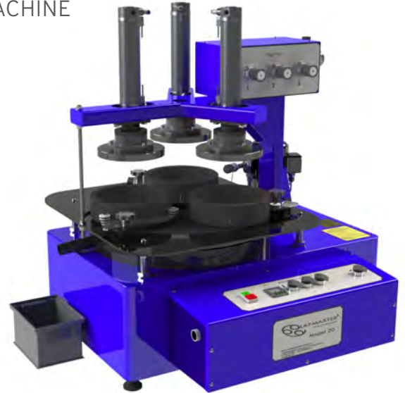
Open face version (left), pneumatic lift version