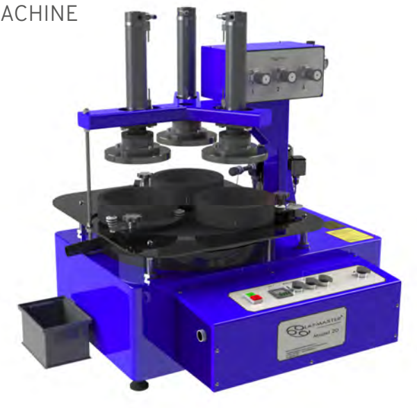
Open face version (left), pneumatic lift version