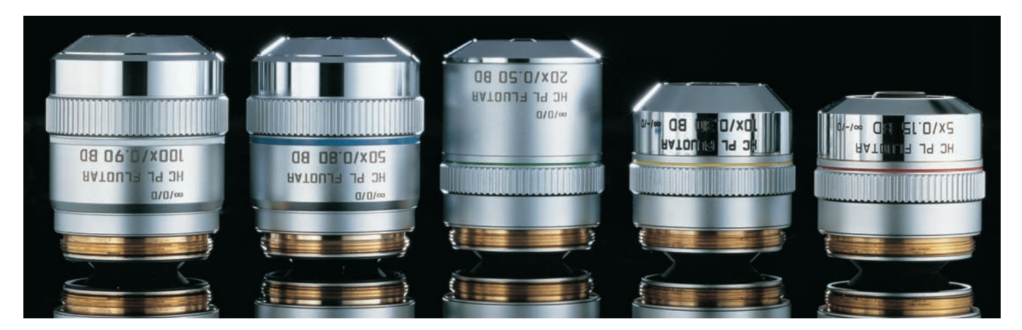
Comprehensive line of objectives - from the HI PLAN (Plan Achromat) to the PLAN APO

The stage drive and focus knob are located very close to each other, which allows the stage and focus to be conveniently adjusted with one hand. Moreover, the flat design of the right focus knob prevents contact with the stage drive.