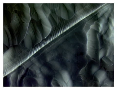
Solar cell, PLAN FLUOTAR 50x, DIC