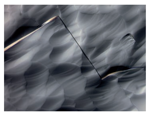
Solar cell, PLAN FLUOTAR 50x, oblique illumination