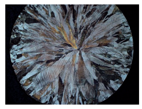
Copper-zinc rod, PLAN FLUOTAR 2.5x, Pol