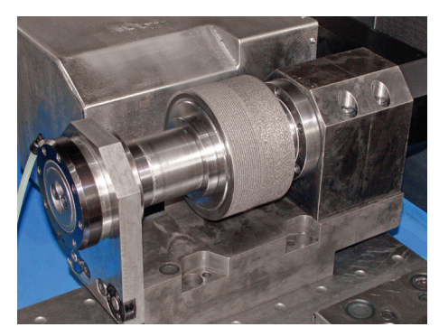
Table dresser with profile roll