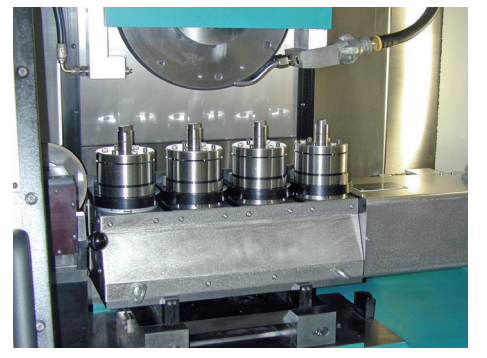
Grinding compartment with clamping fixture