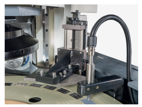
Measuring device for automatic tool wear compensation