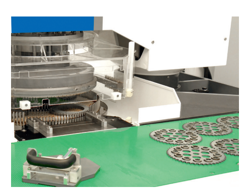
AC 535-F with gap loading table