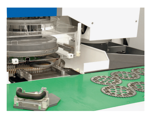
AC 535-F with gap loading table