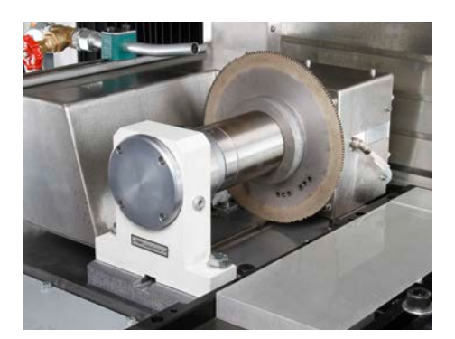
Profile dressing unit