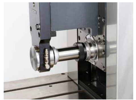
Head mounted diamond roll dressing unit