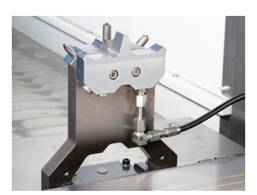
Tilt dressing unit with 3 diamonds