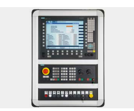
Siemens Sinumerik 840 D